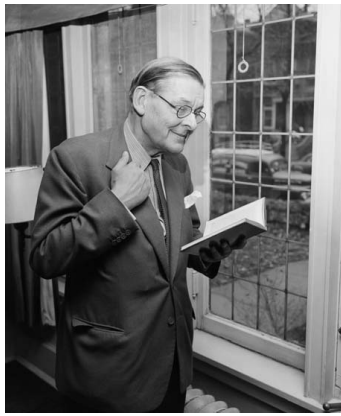
Thomas Stearns Eliot, elected 1954, FHM.