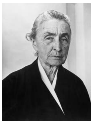
Georgia Totto O'Keeffe, elected 1966.