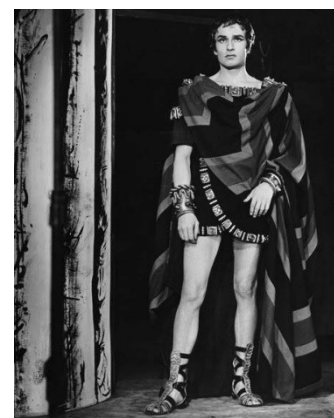
Laurence Kerr Olivier, elected 1971, FHM.