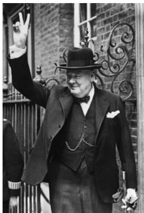
Winston Churchill, elected 1946, FHM.