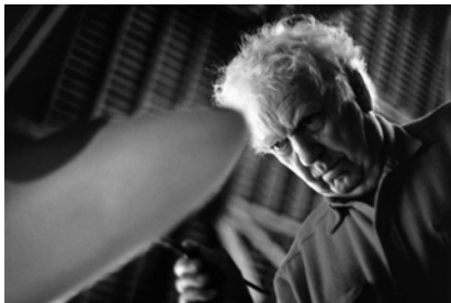
Alexander Calder, elected 1959.

Calasso, Roberto (1941-) Election: 2000, FHM Affiliation at Election: Adelphi Edizioni S.P.A Residence at Election: Milan, Italy Career description: Writer (essayist, fiction writer); Publisher Current affiliation: Same