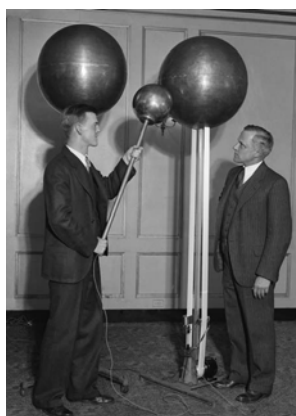
Karl Taylor Compton (right), elected 1931, with Robert Jemison Van de Graaff, elected 1935.

Career description: Physicist; Educator; Academic administrator