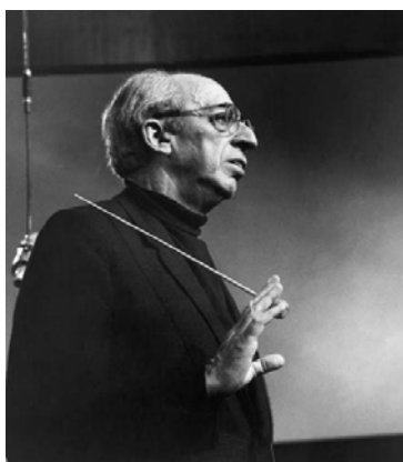
Aaron Copland, elected 1951.