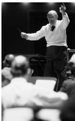
Pablo (Pau Carlos Salvador Defillo de) Casals, elected 1960, FHM.

Career description: Civil engineer; Educator