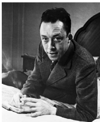
Albert Camus, elected 1959, FHM.