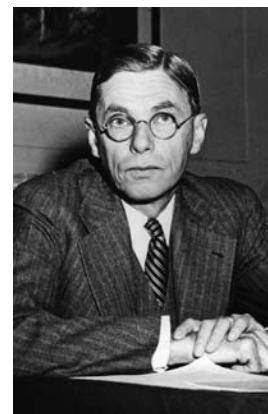
James Bryant Conant, elected 1924.

Career description: Astronomer; Educator; Academic and observatory administrator