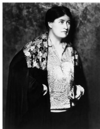
Willa Cather, elected 1943.