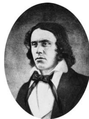
Richard Henry Dana, elected 1864.

Dana, James Dwight (1813-1895) Election: 1845, Associate Fellow Affiliation at Election: New Haven, CT Residence at Election: New Haven, CT Career description: Geologist; Zoologist; Educator