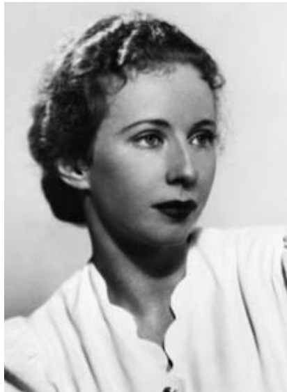
Agnes de Mille, elected 1982

Election : 1982, Fellow Affiliation at election : New York, NY Residence at election : New York, NY Career description : Choreographer; Dancer