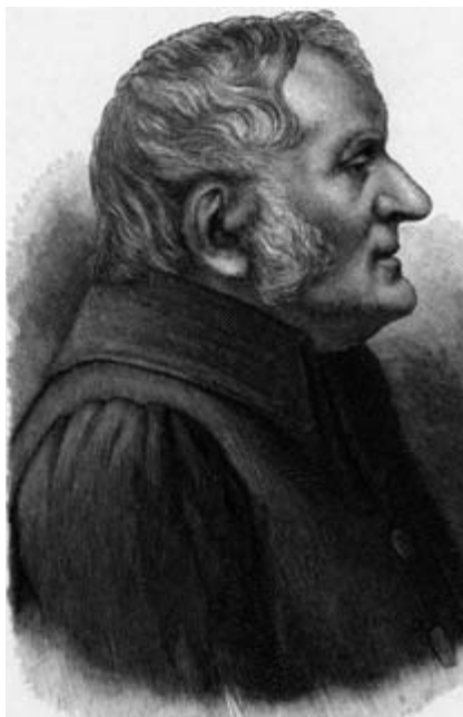
John Dalton, elected 1834