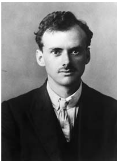
Paul Dirac, elected 1950

Career description : Educator ; Clergy member