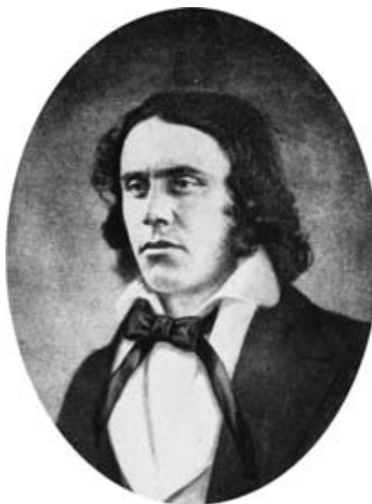
Richard Henry Dana, elected 1864

Election : 1997, Fellow Affiliation at election : University of Iowa Residence at election : Iowa City, IA Career description : Neurologist ; Educator ; Academic research institution administrator Current affiliation : University of Southern California