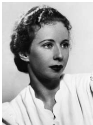
Agnes George de Mille, elected 1982.

de Man, Paul Adolph Michel (1919-1983) Election: 1973, Fellow Affiliation at Election: Yale University Residence at Election: New Haven, CT Career description: Language and literary scholar; Educator