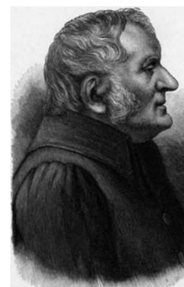
John Dalton, elected 1834, FHM.