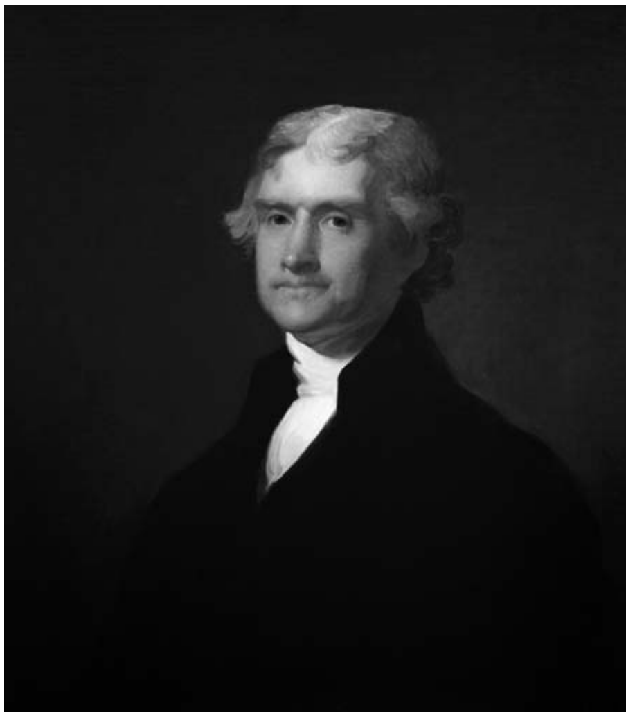
Thomas Jefferson, elected 1787