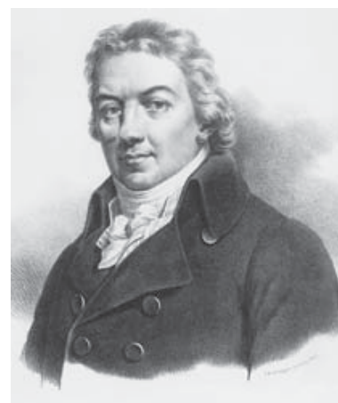
Edward Jenner, elected 1802.