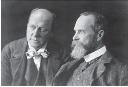
William James (right), elected 1875, with his brother, Henry.