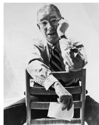
Ogden (Frederick Ogden) Nash, elected 1965.

Career description: Clergy member; Educator; Academic administrator