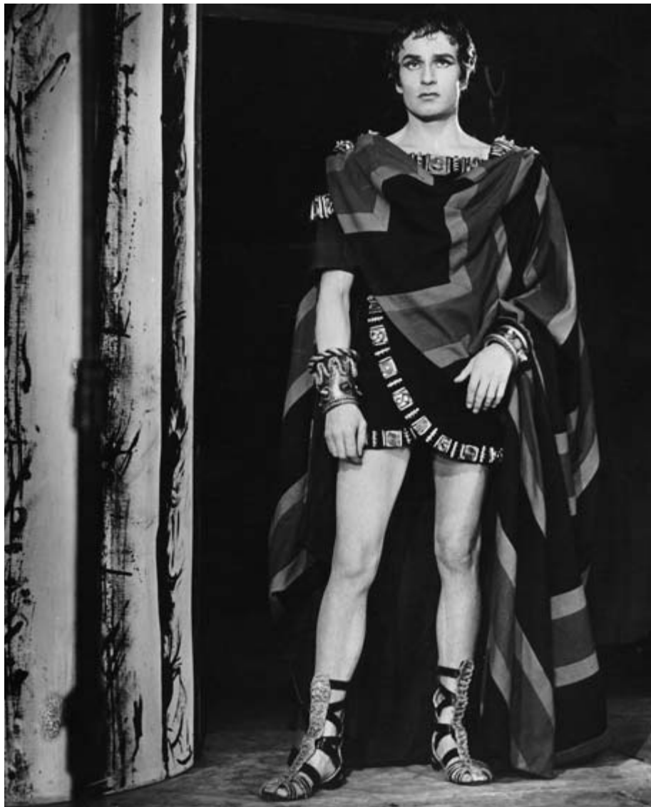
Laurence Olivier, elected 1971