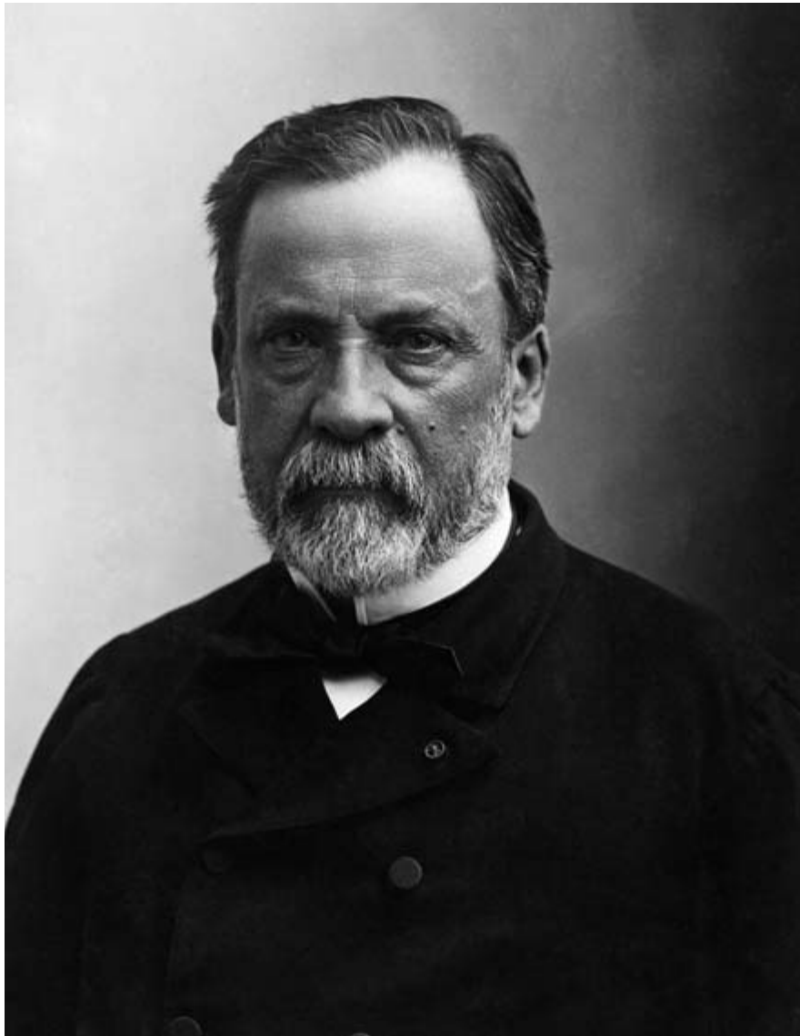
Louis Pasteur, elected 1883