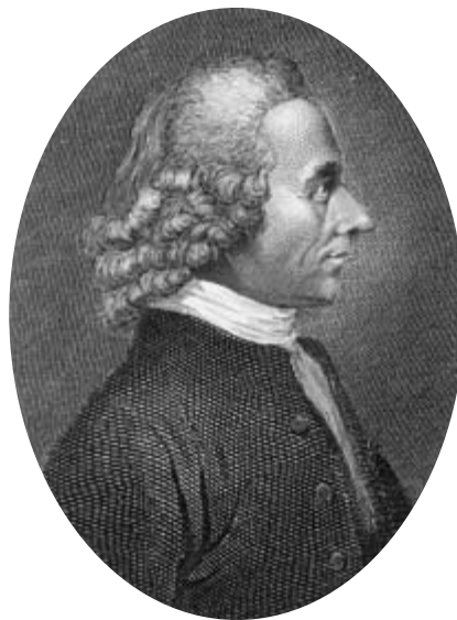
Joseph Priestley, elected 1782

Career description : Banker ; Company executive ; Diplomat