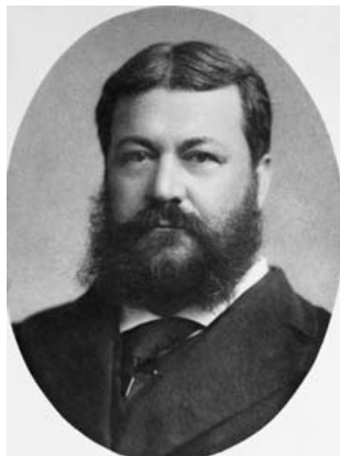
Henry Hobson Richardson, elected 1878.