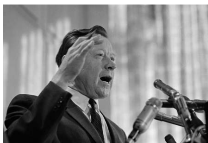
Walter Philip Reuther, elected 1952.

Reuss, Henry Schoellkopf (1912-2002) Election: 1969, Fellow Affiliation at election: U.S. House of Representatives Residence at election: Washington, DC Career description: Government official (legislator); Lawyer