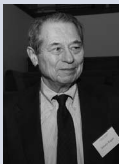
Jerome Kagan Social Sciences