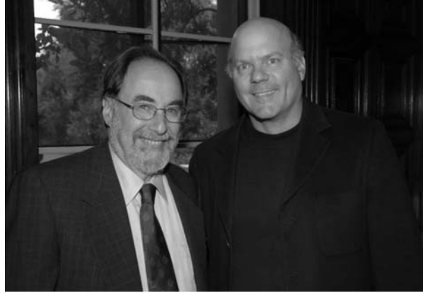
David Baltimore and Colin Camerer (both, California Institute of Technology)