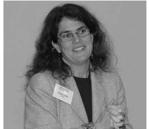
Andrea M. Ghez (UCLA)