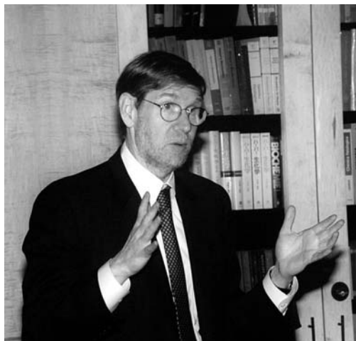
David A. Kessler (UCSF)