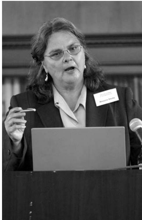
At an informal gathering of Fellows on the Berkeley campus, Randy Schekman, Professor of Cell and Developmental Biology, and Marjorie Shultz, Professor of Law, discussed stem cell research in the laboratory. Their presentations are reprinted on pages 17–22.