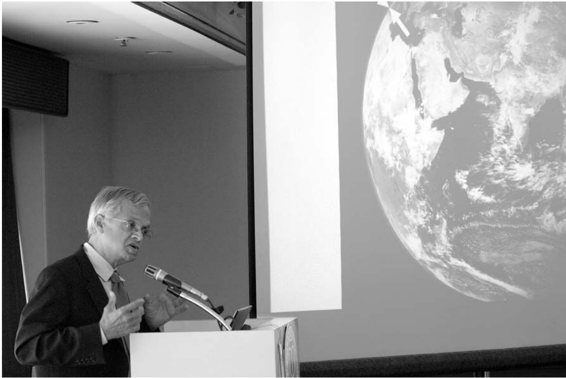
Veerabhadran Ramanathan, Victor C. Alderson Professor of Ocean Sciences and Director of the Center for Atmospheric Sciences, spoke about “Global Warming” at a gathering of Fellows on the University of California, San Diego, campus. His remarks are reprinted on pages 36–38.