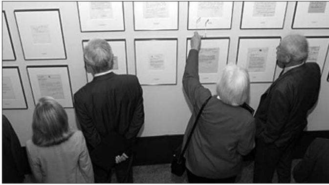
Exhibit from the Academy's Archives

Every newly elected member of the Academy is asked to write a letter of acceptance. The thousands of such letters received over the past 225 years are one of the Academy's most important collections of documents. Now, visitors to the Academy's House in Cambridge can view a selection of these letters in a new exhibit in the atrium. Among the seventy-