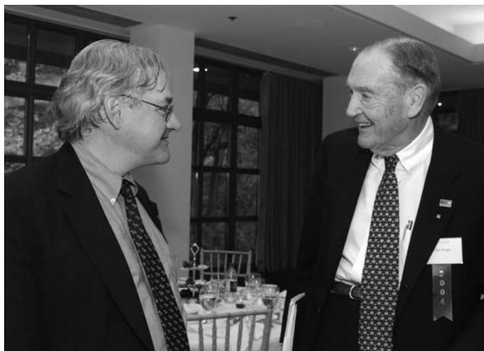
E. J. Dionne, Jr. (Brookings Institution) and John C. Bogle (The Vanguard Group, Inc.)