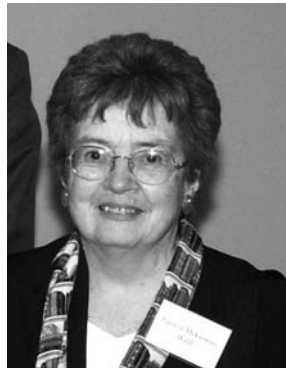
Patricia M. Wald

these issues. Over the last twenty-five years the Court has demonstrated that it can play a more effective role than it has historically by insisting on accountability from legislative and executive officers. It is critical to the future well-being of our society that judges and justices continue to play this role and exercise closer scrutiny of government actions in wartime than they have in the past. Therein lies the path to true safety.