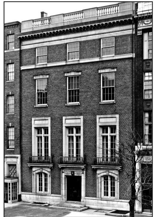
The Academy's rebuilt House (photographed ca. 1940) and the same building today (photograph below)