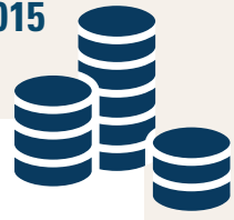
Figure 6: Resource Sources for Select Institutions, FY2015