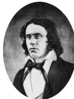
Richard Henry Dana, elected 1864.

Dana, James Dwight (1813-1895) Election: 1845, Associate Fellow Affiliation at election: New Haven, CT Residence at election: New Haven, CT Career description: Geologist; Zoologist; Educator