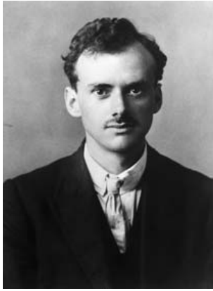
Paul Adrien Maurice Dirac, elected 1950, FHM.

Dirac, Paul Adrien Maurice (1902-1984) Election: 1950, FHM Affiliation at election: University of Cambridge Residence at election: Cambridge, England Career description: Physicist; Educator