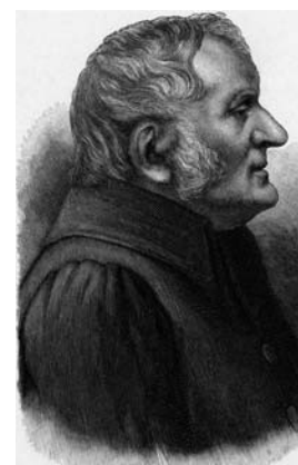
John Dalton, elected 1834, FHM.

Current affiliation: Oregon State University