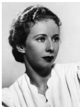
Agnes George de Mille, elected 1982.