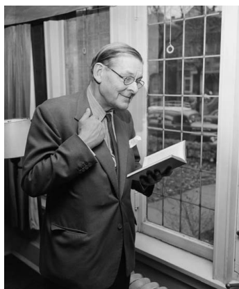
Thomas Stearns Eliot, elected 1954, FHM.

Eliot, Thomas Stearns (1888-1965) Election: 1954, FHM Affiliation at election: Faber & Faber, Ltd. Residence at election: London, England Career description: Writer (poet, playwright, literary critic); Editor