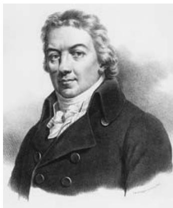
Edward Jenner, elected 1802, FHM.

Career description: Clergy member; Biblical and Orientalist scholar