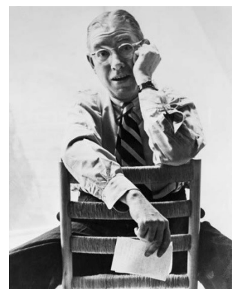
Ogden (Frederick Ogden) Nash, elected 1965.