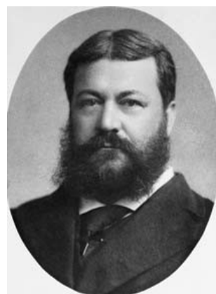
Henry Hobson Richardson, elected 1878.

Career description: Archaeologist; Educator