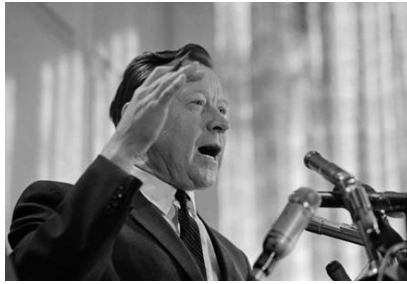
Walter Philip Reuther, elected 1952.

Career description: Government official (legislator); Lawyer