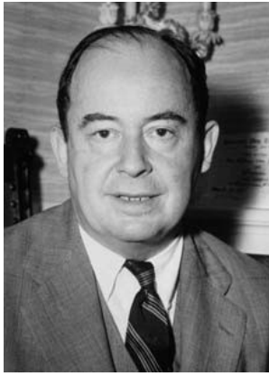
John von Neumann, elected 1944.