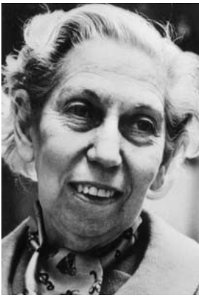
Eudora Welty, elected 1969.