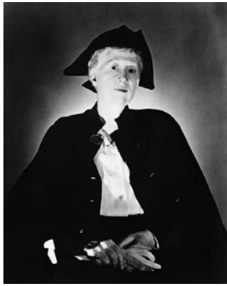
Marianne Craig Moore, elected 1962.

Moore, Marianne Craig (1887-1972) Election: 1962, Fellow Affiliation at election: New York, NY Residence at election: New York, NY Career description: Writer (poet, essayist)