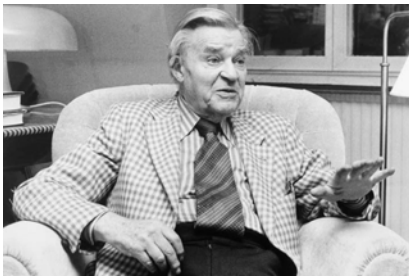
Karl Gunnar Myrdal, elected 1958, FHM.