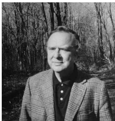
Robert Motherwell, elected 1985.