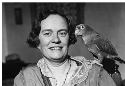
Margaret Mead, elected 1948.