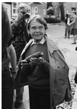
Barbara McClintock, elected 1959.

Career description: Psychologist; Educator; Research institution administrator