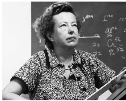
Maria Gertrude Goepfert Mayer (Goepfert-Mayer), elected 1965.

Current affiliation: Leibniz Association