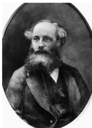
James Clerk Maxwell, elected 1874, FHM.