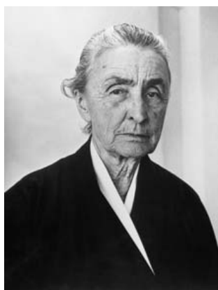
Georgia Totto O'Keeffe, elected 1966.

Career description: Astronomer; Educator