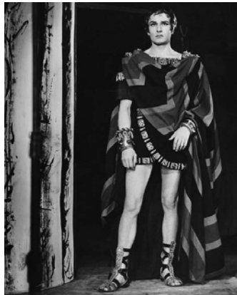
Laurence Kerr Olivier, elected 1971, FHM.