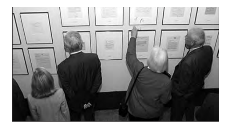
Exhibit from the Academy's Archives

Every newly elected member of the Academy is asked to write a letter of acceptance. The thousands of such letters received over the past 225 years are one of the Academy's most important collections of documents. Now, visitors to the Academy's House in Cambridge can view a selection of these letters in a new exhibit in the atrium. Among the seventy-