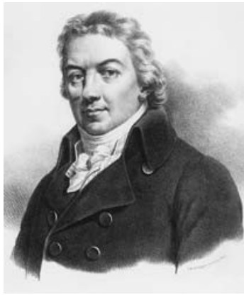
Edward Jenner, elected 1802, FHM.