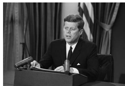
John Fitzgerald Kennedy, elected 1955.