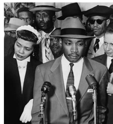
Martin Luther King, Jr., elected 1966.