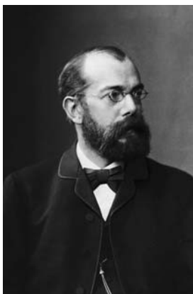
Robert (Heinrich Hermann Robert) Koch, elected 1901, FHM.

Career description: Writer (poet, playwright); Educator