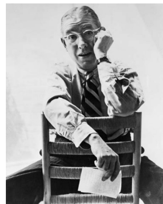
Ogden (Frederick Ogden) Nash, elected 1965.