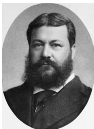
Henry Hobson Richardson, elected 1878.

Career description: Archaeologist; Educator