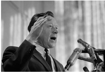
Walter Philip Reuther, elected 1952.

Career description: Government official (legislator); Lawyer