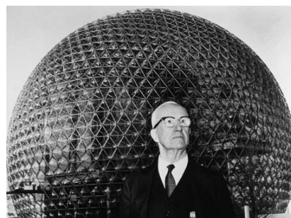
Richard Buckminster Fuller, elected 1968.

Career description: Lawyer; Jurist (U.S. Supreme Court)