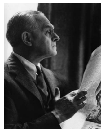
Felix Frankfurter, elected 1932.