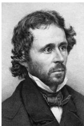
John Charles Fremont, elected 1850.