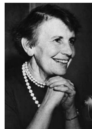
Anna Freud, elected 1959, FHM.

Frenkel, Jacob Aharon (1943-) Election: 1996, FHM Affiliation at election: Bank of Israel Residence at election: Jerusalem, Israel Career description: Economist; Educator; Company executive (banking and investment) Current affiliation: JPMorgan Chase International