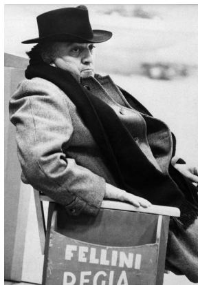
Federico Fellini, elected 1967, FHM.

Election: 1958, Fellow Affiliation at election: Princeton University Residence at election: Princeton, NJ Career description: Mathematician; Educator