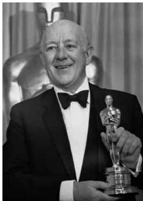
Alec Guinness, elected 1961, FHM.