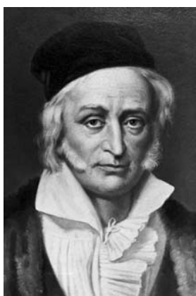
Carl Friedrich Gauss, elected 1822, FHM.

Career description: Political scientist; Educator