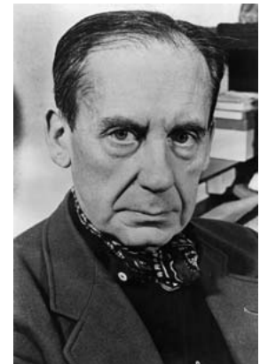
Walter Adolf Georg Gropius, elected 1944.

Groopman, Jerome (1947-) Election: 2008, Fellow Affiliation at election: Harvard Medical School; Beth Israel Deaconess Medical Center; The New Yorker Residence at election: Boston, MA Career description: Physician; Journalist Current affiliation: Same