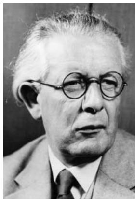
Jean Piaget, elected 1957, FHM.