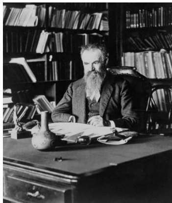
John Wesley Powell, elected 1887, Associate Fellow.