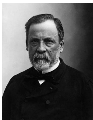
Louis Pasteur, elected 1883, FHM.