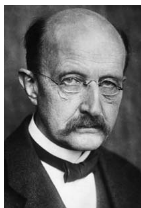
Max Karl Ernst Ludwig Planck, elected 1914, FHM.