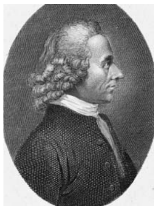
Joseph Priestley, elected 1782, FHM.