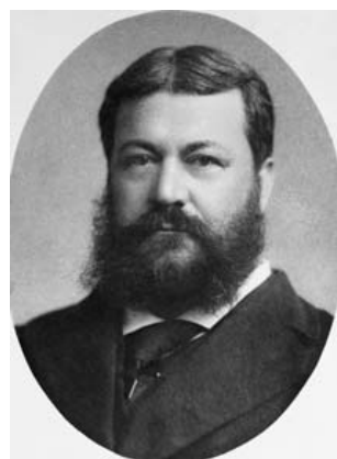
Henry Hobson Richardson, elected 1878.

Career description: Archaeologist; Educator