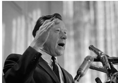
Walter Philip Reuther, elected 1952.

Career description: Government official (legislator); Lawyer