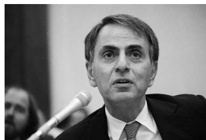
Carl Edward Sagan, elected 1978.