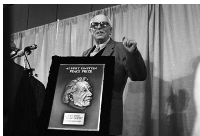
Andrei Dmitriyevich Sakharov, elected 1969, FHM.