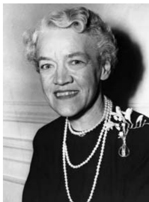
Margaret Chase Smith, elected 1952.

Election: 1970, Fellow Affiliation at election: University of California, San Francisco Residence at election: San Francisco, CA Career description: Physician; Educator; Academic administrator