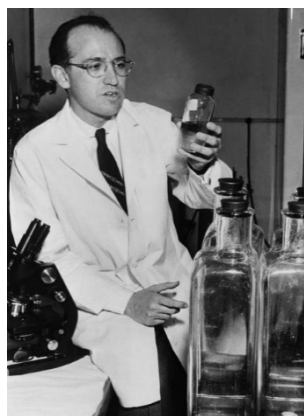
Jonas Edward Salk, elected 1966.