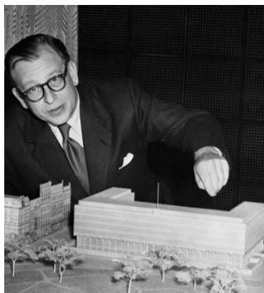
Eero Saarinen, elected 1954.

Election: 2012, FHM Affiliation at election: Paris, France Residence at election: Paris, France Career description: Musician (composer) Current affiliation: Same