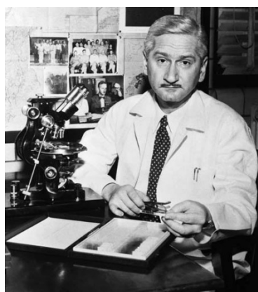
Albert Bruce Sabin, elected 1955.

Election: 2000, Fellow Affiliation at election: University of California, Los Angeles Residence at election: Los Angeles, CA Career description: Historian; Educator Current affiliation: Same