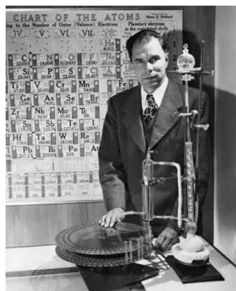
Glenn Theodore Seaborg, elected 1958.