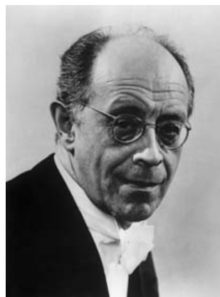
Rudolf Serkin, elected 1960.