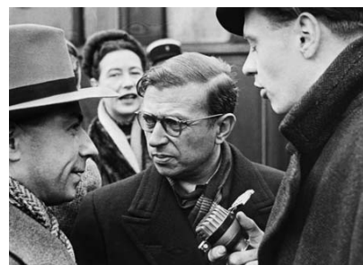
Jean-Paul Sartre, elected 1960, FHM.

Sartori, Giovanni (1924-2017) Election: 1975, FHM Affiliation at election: University of Florence Residence at election: Florence, Italy Career description: Political scientist; Educator