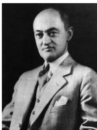
Joseph Alois Schumpeter, elected 1933.