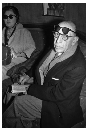
Igor Fyodorovich Stravinsky, elected 1940, FHM.

Stravinsky, Igor Fyodorovich (1882-1971)