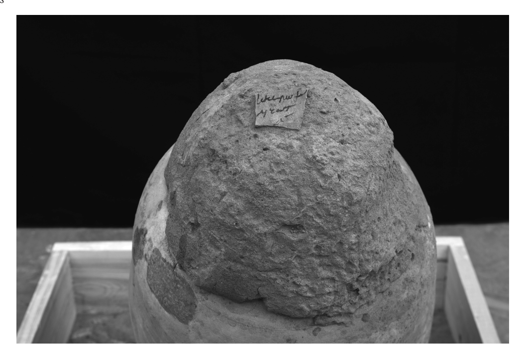
Trimithis (Amheida), third-to-fourth century AD.

writing itself have come to support inquiry into the entire social dimension of the technology of writing in ancient society.