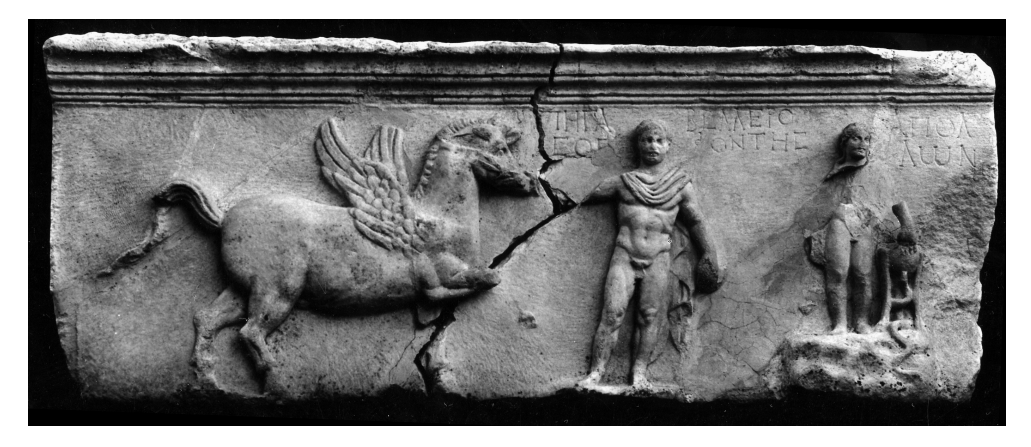
Figure 2 Relief Panel in the Civil Basilica of Aphrodisias

This panel features Bellerophon, the mythological founder of the city, together with Apollo and his horse Pegasus. It dates from the late first century CE.