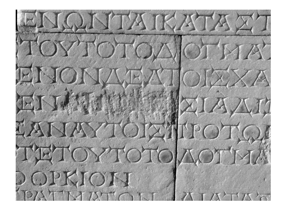
The pagan name Aphrodisias, in the fourth line, was erased by the Christians.

Christians, Jews, and a strong group of philosophically educated followers of the polytheistic religions all competed in Aphrodisias for the support of citizens who were asking the same questions: Is there a god? And how can we attain a better afterlife? Before imperial legislation awarded victory to Christianity, a long period of religious dialogue and mutual influence - but also of violent conflict-dominated life in Aphrodisias.<sup>28</sup> Inscriptions and graffiti reflect this religious atmosphere, and the predominant role religious identity played in the city. While the Christians engraved their religious symbols (the cross, fish) and acclamations, the pagans engraved theirs, such as the double axe (see Figure 3). Representations of menoroth in the Sebasteion indicated that shops in respective areas were owned by Jews (see Figure 4). Around 480 CE, an honorary epigram